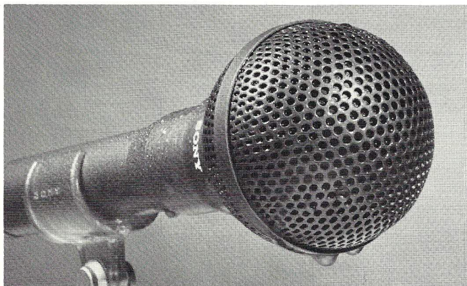
F-115 with accessory wind screen for severe weather conditions